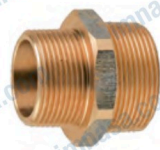
Rosca / Thread EN 10226 / 1 (BS21)

Machón fabricado en bronce. Mamelon male en bronze. Coupler in bronze.